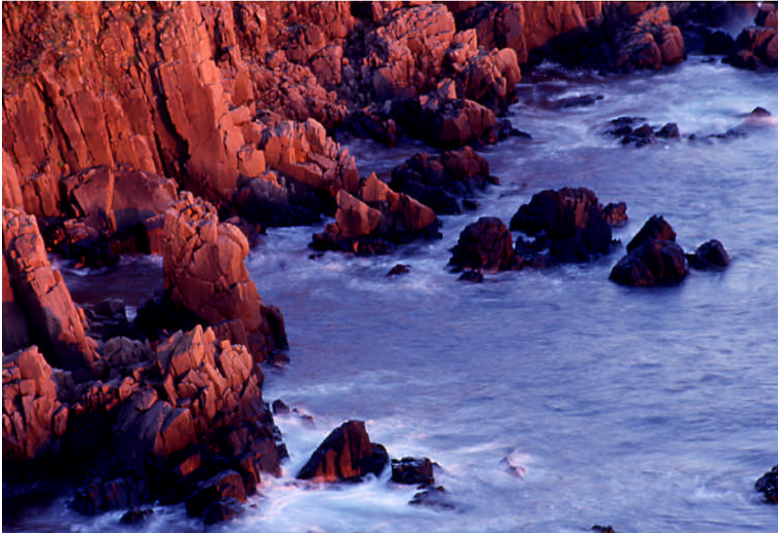
Rocks, Grand Manan Island NB.